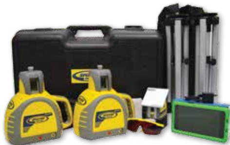
The QML800 all-inclusive package consists of 2 lasers, 2 tripods with canvas bag, Nexus controller, LP30 pointer and beam interceptor, chargers, laser enhancement glasses, carrying case and instructions