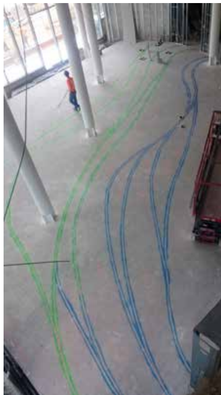
Layout complex shapes quickly and accurately